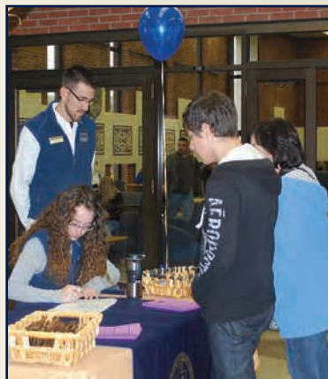
BELOW RIGHT: The Pancake Breakfast was a hit with students Saturday morning.