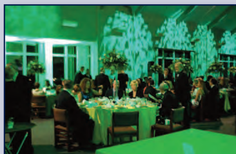
The 2010 La Cultura Winter Gala celebrated "moving toward a greener future."

Plans are moving forward for this year's La Cultura Winter Gala, scheduled for January 15, 2011. Watch for details about this year's event. This is the 10th anniversary of the event, which benefits the President's Scholarship Fund. Tickets purchased before December 15 receive a $15 discount. Call 724-836-9942 for information about being a sponsor or purchasing tickets. ▲