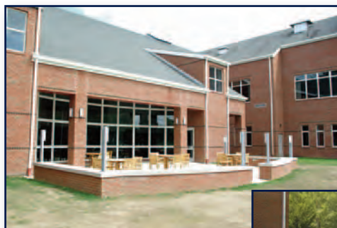
A new patio area at Millstein Library highlights the summer renovations to the building.

With the installation of a new sprinkler system in Robertshaw Hall, all residence halls on campus have sprinkler systems.