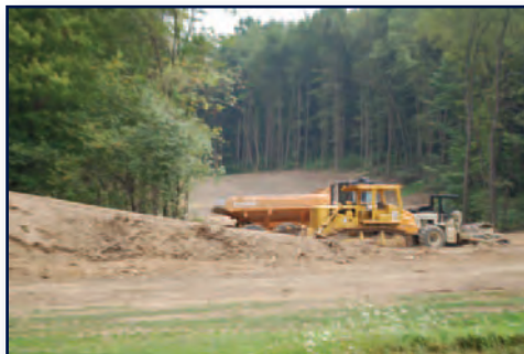
Construction began in July for the new women's softball field.

The most noticeable construction on campus is the new women's softball field that will be located across the road from the main portion of campus. Construction began on this project in July and is expected to be finished in October. The result will be an NCAA Division III regulation softball field that includes two cement dugouts, a batting cage, a pitching box for warm-ups, and parking for 20 to 25 vehicles.