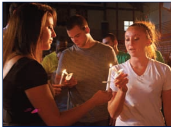
First-Year Student Convocation marks the start of the academic year. The memories are just beginning for this first-year class.