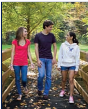
Blue & Gold Weekend is a great opportunity to enjoy autumn on the beautiful Pitt-Greensburg campus.

When asked, alumni are quick to share their favorite things about Pitt-Greensburg and their memories.