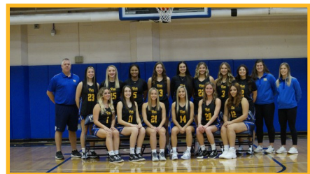
The '22-'23 Women's Basketball Team