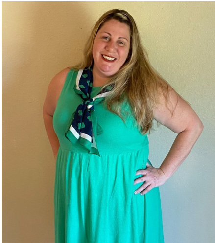
Audra Lewis